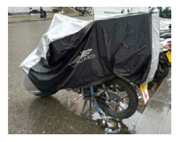
Figure 4 – A lock and chain set has been attached to a ground anchor, but the chain has also been run through the rear wheel and frame. A bike cover also adds a further layer of security to delay or deter a thief, not just waterproofing.

Some products are not security rated, but are still of great use in deterring or preventing theft, such as bike covers, grip locks and one way screws for number plates.