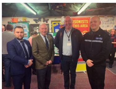
Rural Evening Event