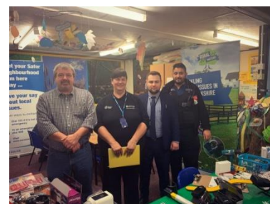
Rural Evening Event