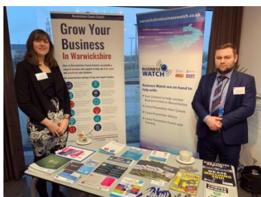
NWBC Growing Economy Hams Hall Event